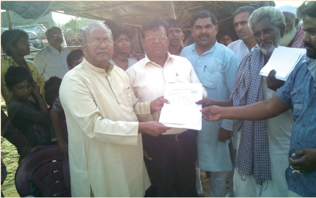
Visit of Chairman and Member to the State of Rajasthan and receiving representations/grievances from local DNT/NT people